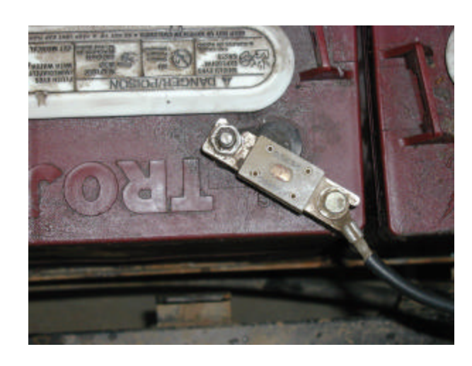
Example 1: On Battery